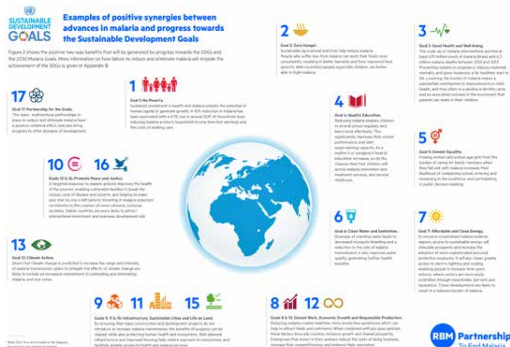
✓ Figure 1: Examples of positive synergies between advances in malaria and progress towards the Sustainable Development Goals.