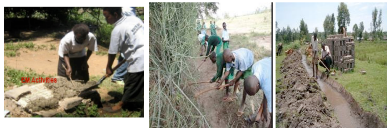
Plate 1: Water management and Larval source reduction

Epidemiological assessment of malaria cases show a 62% and 51.5% reduction in Malindi and Nyabondo respectively (Figure 2).