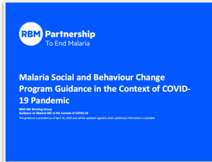
Malaria SBC Program Guidance in the Context of the COVID-19 Pandemic English / French