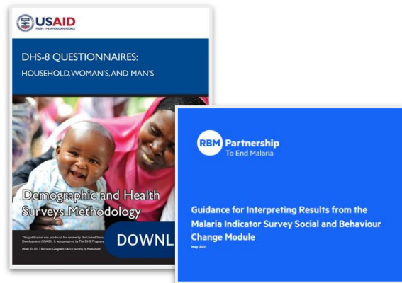
Malaria Indicator Survey SBCC Module, Interviewer's Manual, Interpretation Guidance English / French