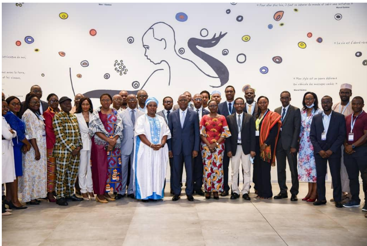
Meeting Participants Group photo

RBM Country Regional Support Partner Committee (RBM/CRSPC) Central Africa Malaria Programs and Partners annual review and planning meeting, Brazzaville, Republic of Congo 9-12 August 2022.