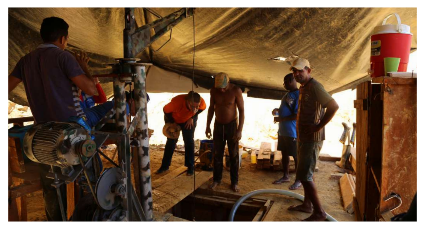
Suriname Gold mining images, copyright PAHO_WHO Photo by Sonia Mey Schmidt