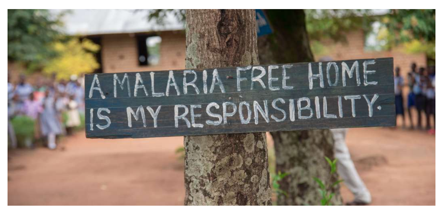
Uganda/Malaria Smart Schools images.

A coordinated and whole-of-government approach is essential for both successful malaria elimination and outbreak response. Ensuring that leadership from all ministries focuses on efforts to drive down malaria and other outbreaks provides the political will and resources necessary to protect health in the face of emerging disease threats.