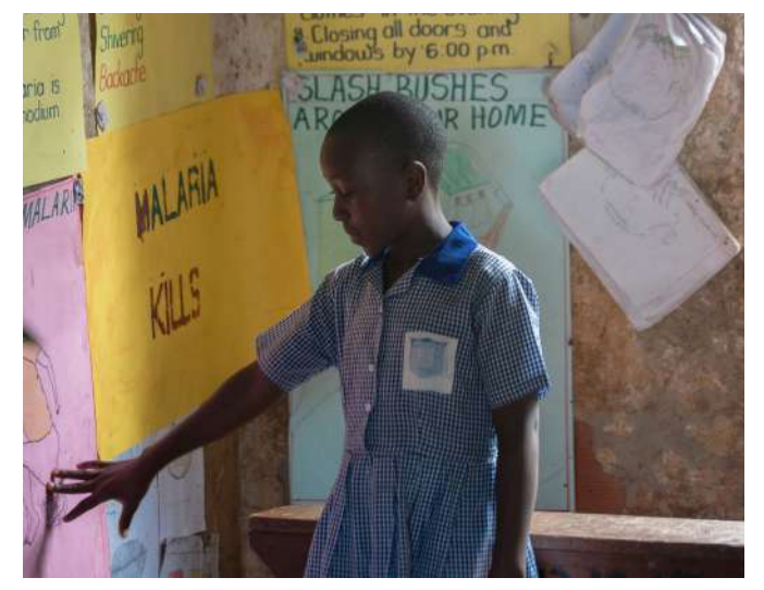
Uganda/Malaria Smart Schools images.