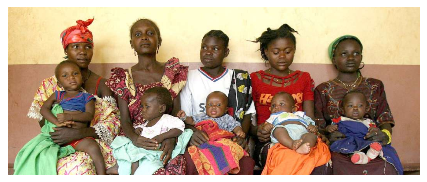
Women and children waiting at a health centre, Central African Republic.