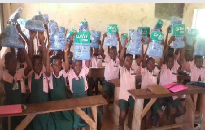
Standard Operating Procedure materials (top); Teachers administering treatment to pupils (centre); Pupils receiving long-lasting insecticidal nets (bottom).