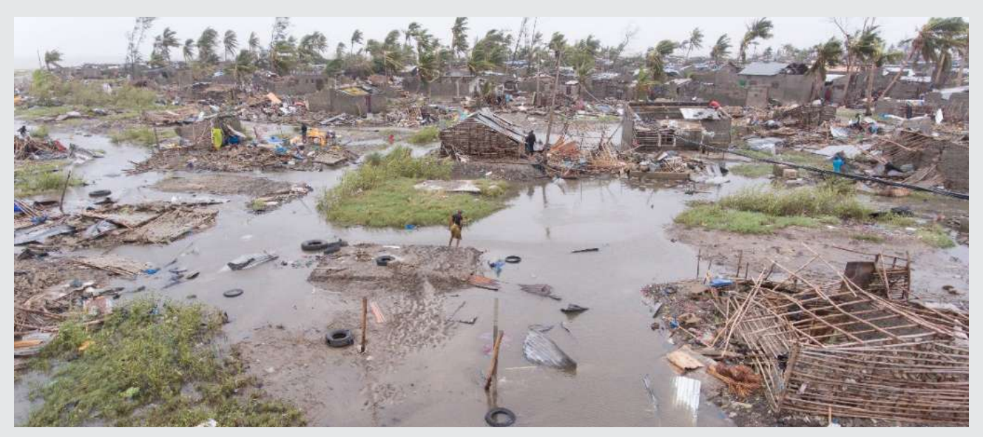
Aftermath of Cyclone Idai, Mozambique, 15–16 March 2019.