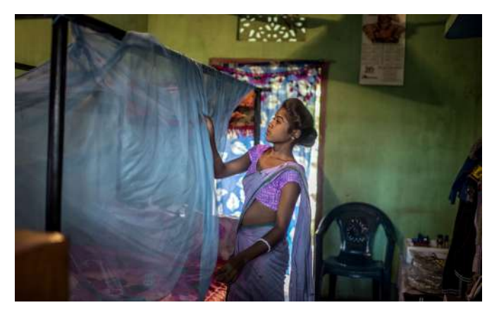
Young woman using an insecticide treated net in Assam, India.

Multisectoral action on malaria is related to the concepts of the World Health Organization's Health-In-All-Policies<sup>15</sup> which highlights that policies in other sectors have the potential to improve human health – and to One Health,<sup>16</sup> a collaborative, multisectoral and transdisciplinary approach that recognizes the interconnectedness of human, environmental and veterinary health. This guide specifically focuses on actions on malaria, but some of the interventions that are effective against malaria – particularly those related to environmental health and management – may also be effective against other diseases, particularly water-related or vector-borne diseases.