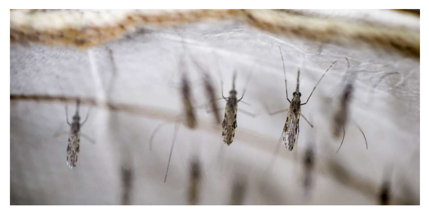
Anopheles mosquitos in the lab of the KEMRI/CDC research institute outside Kisumu, Kenya.

Each brief provides a contextual analysis of the specific elements or practices of the sector in question that drive malaria transmission, followed by a list of promising entry points for multisectoral engagement between the sector and the malaria community. This includes multisectoral, malaria-smart interventions that may increase the impact of overall health sector investments, expand the health benefits of investments beyond the sector and contribute