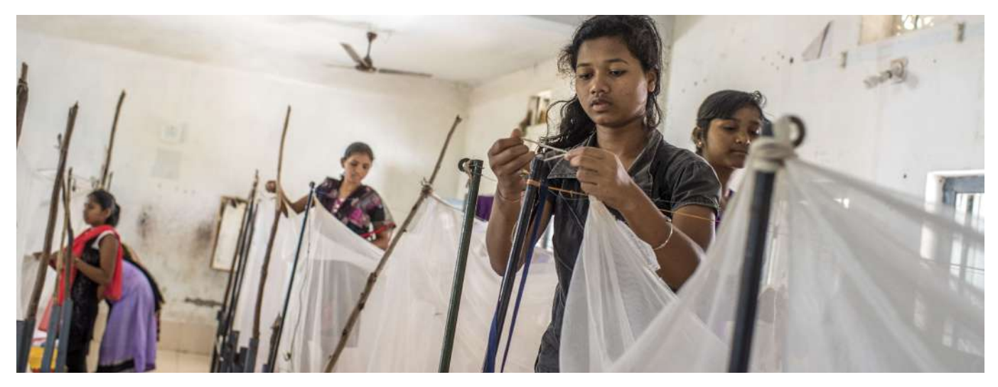
Young girls using insecticide treated nets in the hostel of a government-run girls high school in Odisha, India.

• HIAs: a systematic approach to identify adverse effects and health opportunities of development projects upon which to develop a multisectoral public health management plan. In this way, the environmental and social determinants of health can be managed in the context of development projects.