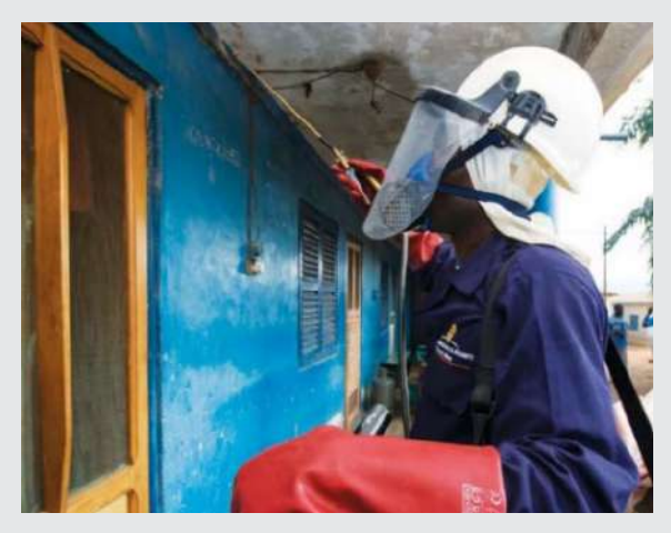
Indoor residual spraying in Obuasi, Ghana

Since 2011, this public-private partnership between the Government and AngloGold Ashanti has received additional funding from external sources, including from the Global Fund to Fight AIDS, Tuberculosis and Malaria in its capacity as a Principal Recipient, the funds from which cover Obuasi and 12 other districts in the Upper West and Upper East regions of Ghana. AngloGold Ashanti has also started working with the mining community in Geita, Tanzania, partnering with the Government and other NGOs to create community-based malaria initiatives that support the national malaria strategy.