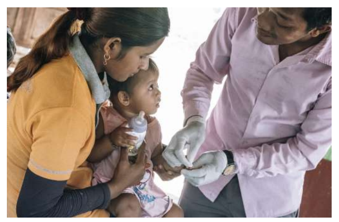
A village malaria worker is testing a young child for malaria in Battambang Province, Cambodia.

Malaria poses unique risks to people experiencing prolonged or acute displacement. High levels of mobility, displacement to malaria-endemic areas and poor living conditions can contribute to increased risk of exposure and decreased access to health services in humanitarian emergencies.<sup>3</sup> Travel may take refugees – including those with little or no immunity – through or to areas of higher malaria endemicity than their place of origin, and almost two-thirds of refugees, internally displaced persons (IDPs), asylum seekers, returnees and other persons affected by humanitarian emergencies live in malaria-endemic regions. Refugee and IDP camps are often built on marginal lands in conditions