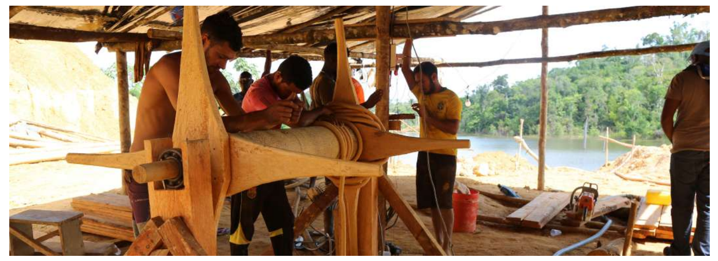
Suriname Gold mining images

<sup>1</sup> Magnus Ericsson and Olof Löf, "Mining's contribution to national economies between 1996 and 2016," Mineral Economics, vol. 32 (June 2019), pp. 223–50.