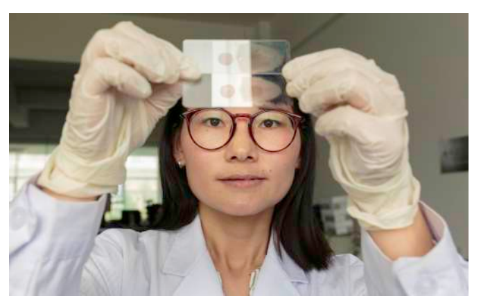
A laboratory specialist holds blood smears that she will examine under a microscope for malaria parasites at the Yunnan Institute for Parasitic Diseases, Pu'er Simao, Yunnan, China.