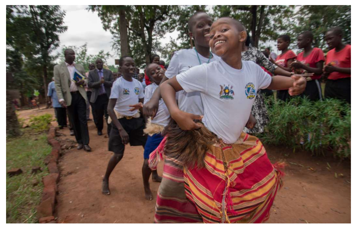
Uganda/Malaria Smart Schools images.

Boarding schools are particularly important targets for vector control measures to protect school-age children from malaria. IRS spraying of boarding schools is important to achieve community-wide IRS coverage and protect school-age children while sleeping. Installing window and door screens in dormitories, ensuring bednet usage among students, and encouraging students to prevent bites through use of repellent or wearing long-sleeved shirts and trousers can all help protect students at boarding schools from malaria infection.