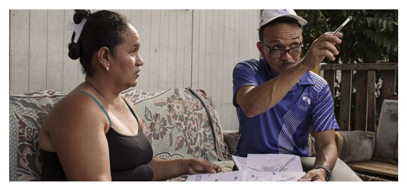
Health inspector shows an area map with the mosquito-prone areas to a resident of Estreda, during a routine house-to-house malaria control visit, Costa Rica.

Evidence will be essential for mobilizing any funds required to ensure malaria-smart infrastructure. More systematic planning with increased availability of dedicated health impact tools and interdisciplinary and multisectoral collaboration help to prevent the negative impacts of building or improving infrastructure while enhancing the health benefits of increased access to clean water, safe housing and electricity. Impact assessments are an effective tool to gather evidence to develop a well-informed multisectoral action plan while opening up clearer avenues for multisectoral investment in malaria. Such assessments may include Health Impact Assessments, Environmental Impact Assessments, Economic Impact Assessments and cost-benefit analyses. For more information on impact assessments, see page \frac{9}{2} , for more details on financing multisectoral action for malaria, see page 11.