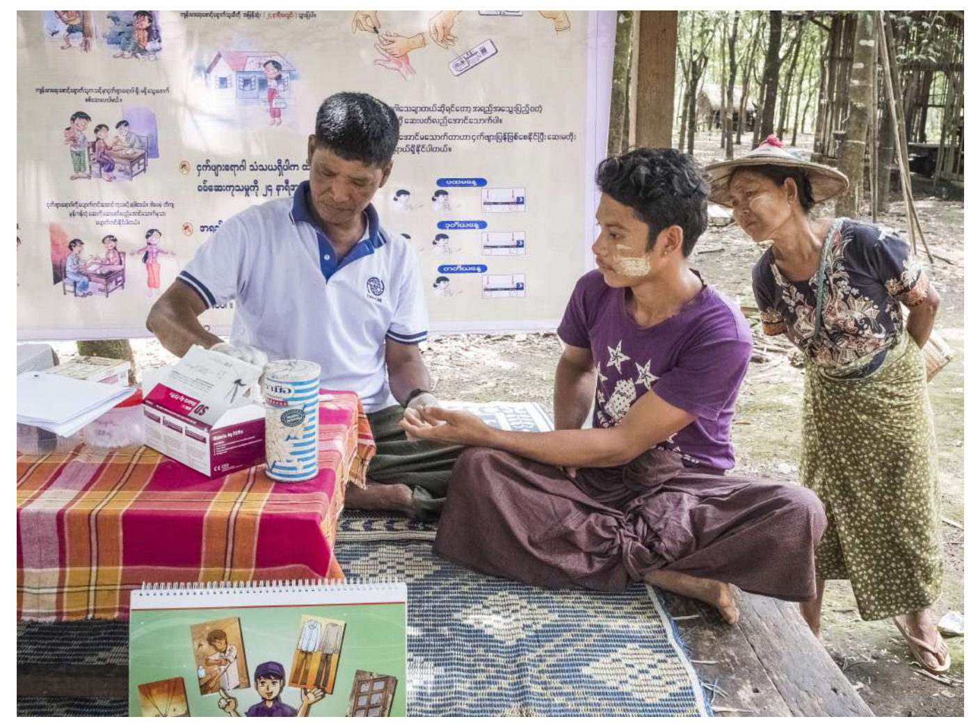
A health care provider and IOM volunteer is conducting malaria rapid tests at Kwai Camp in Mon State, where migrant workers live and work on a rubber plantation, Myanmar.

Effective multisectoral action and coordination is at the heart of a rapid and impactful emergency response. Through continued partnership and planning across sectors, key actors in an emergency response can take specific and targeted actions to simultaneously prevent malaria outbreaks following emergencies and enhance emergency response efforts by leveraging existing systems put in place for malaria control.