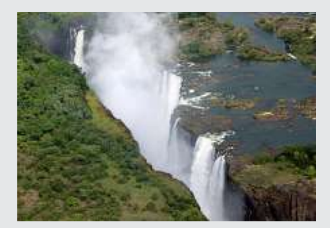
Victoria Falls – Zimbabwe, Zambia.

Key actors: Map the partner landscape and make connections with the key country or regional actors in the tourism industry. Build relationships with actors in other sectors and convince them of the need for and mutual