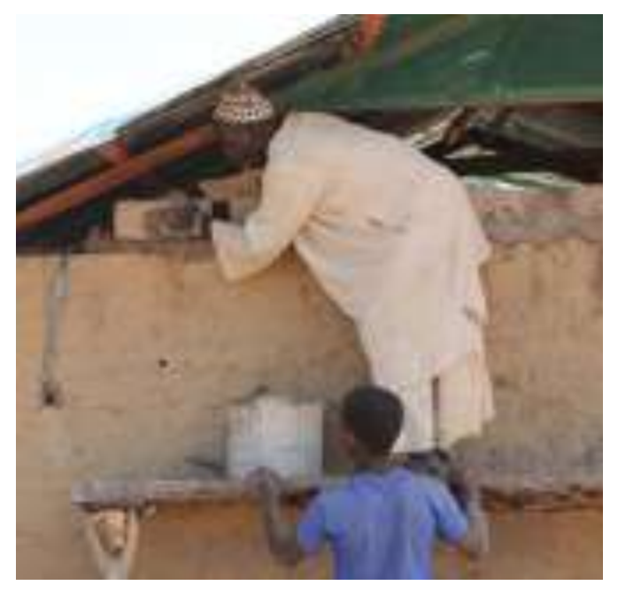
Closing Eave Gaps in the Gambia.