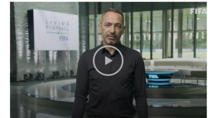
Youri Djorkaeff, CEO FIFA Foundation