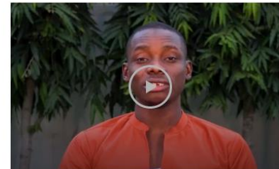
Sidiki Diabaté, musician