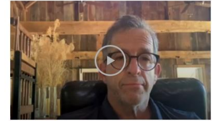
Kenneth Cole, designer, activist and UNAIDS International Goodwill Ambassador