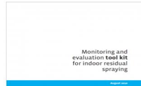
WHO Monitoring and Evaluation Tool Kit for Indoor Residual Spraying