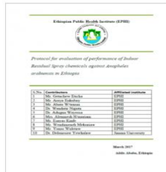
Protocol for Evaluation of Performance of Indoor Residual Spray Chemicals Against Anopheles Arabiensis in Ethiopia