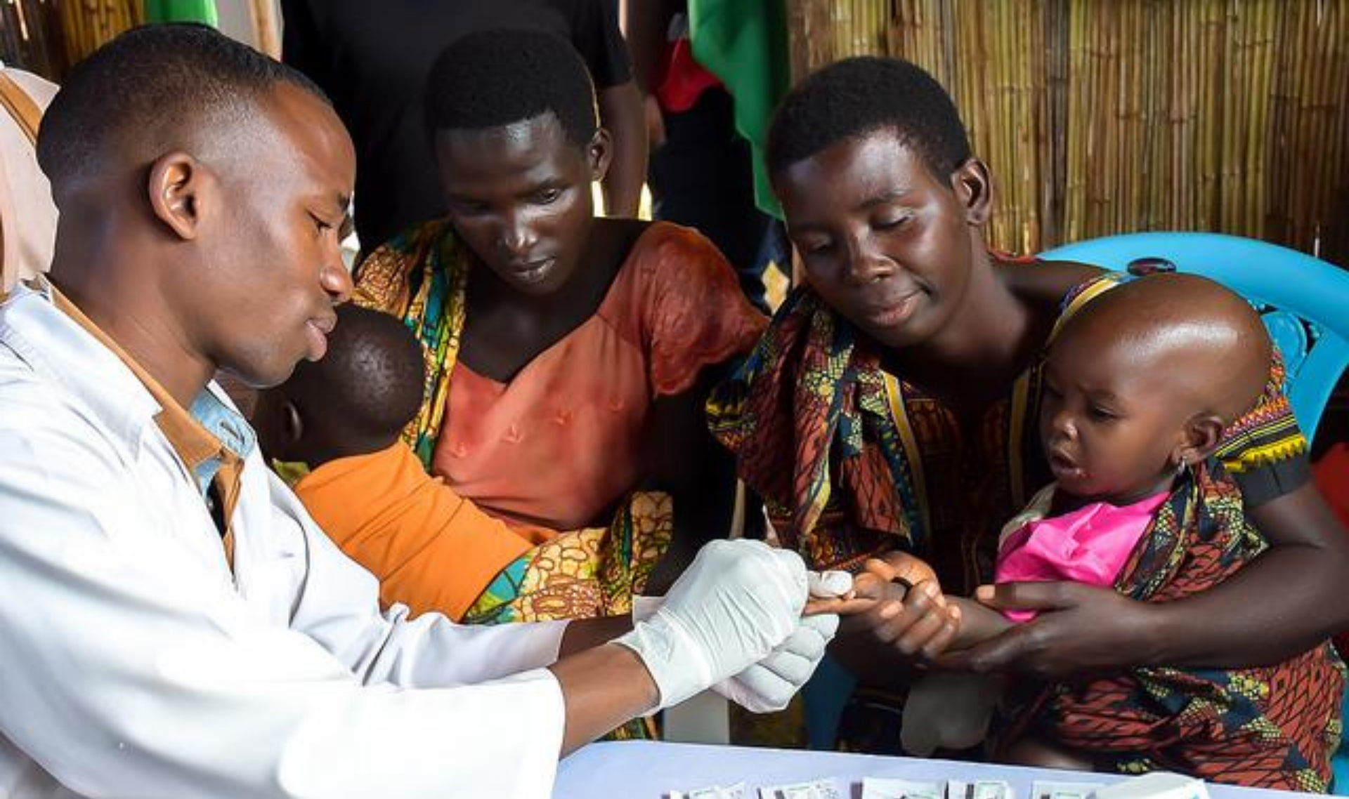
Mothers and Babies accessing community Malaria counselling and testing during inauguration of World Malaria Day (WMD) in Kasulu, Western Tanzania