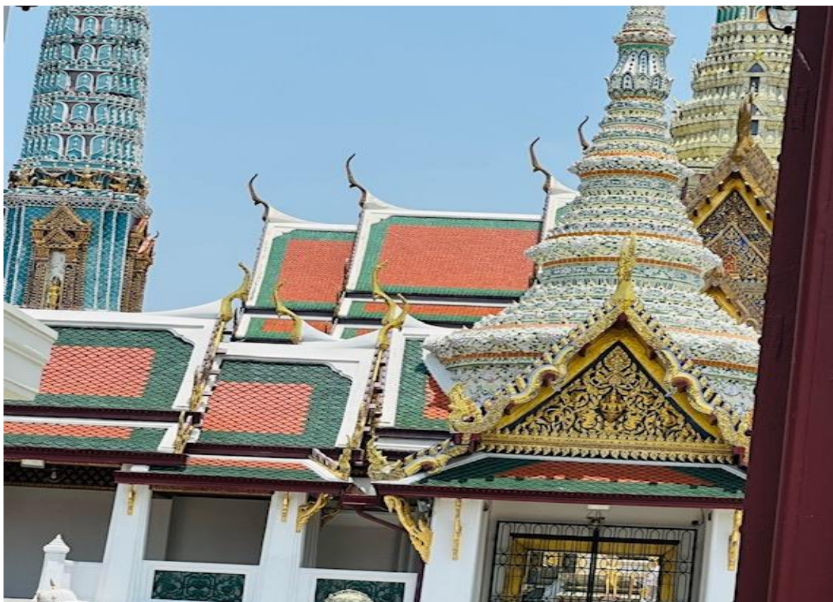
Thai Palace.