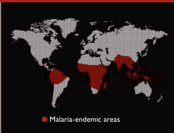
● Malaria-endemic areas

Now it's time for the rest of the world.