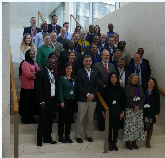
Participants of the MSWG-2 February 2019