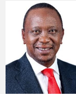
His Excellency Uhuru Kenyatta, President of the Republic of Kenya and current ALMA Chair