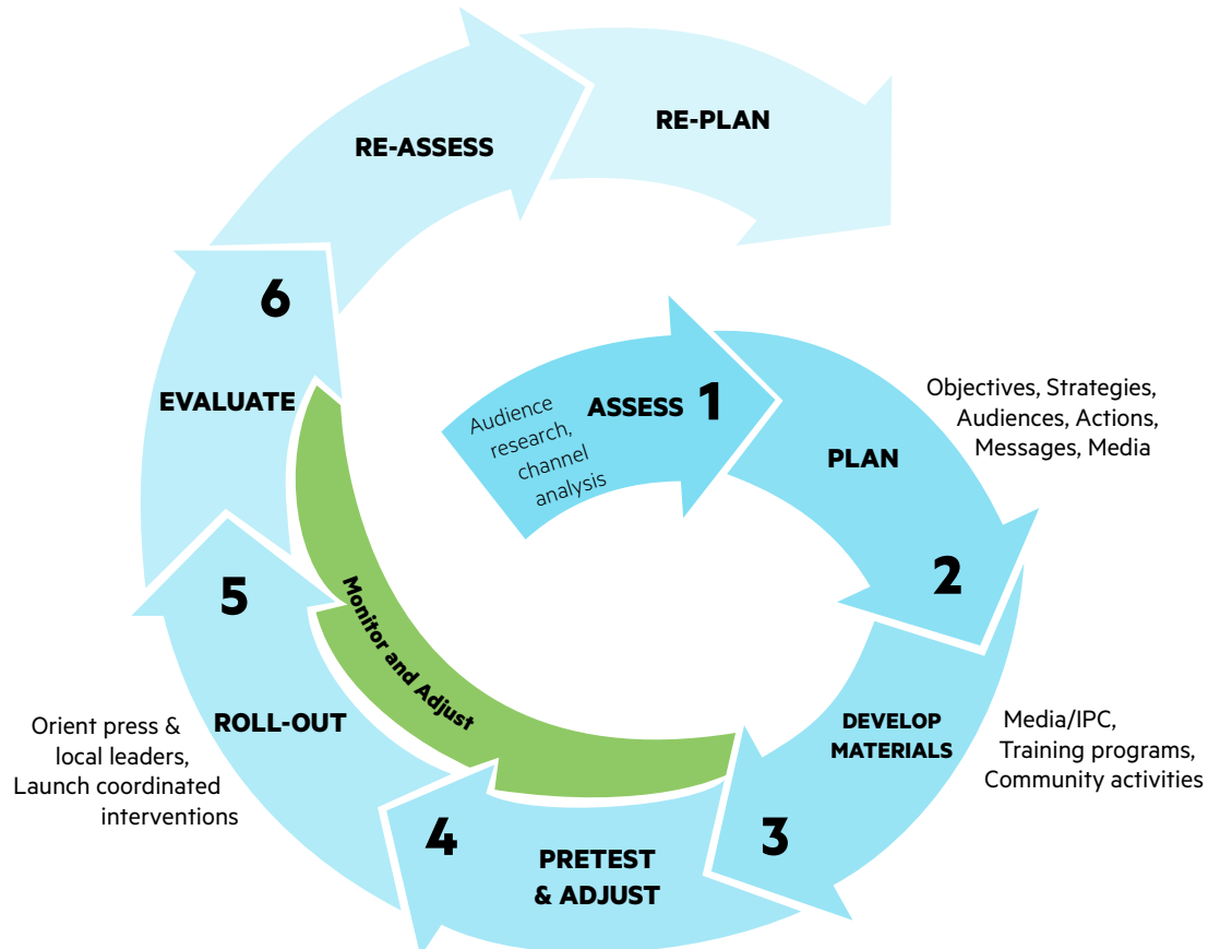
Figure 3: Systematic and Iterative SBCC Planning Process

Audience analysis: Malaria control programmes focus on populations most at risk, including those in specific regional, socioeconomic and biological groups, such as pregnant women. Accordingly, socio-demographic and psychographic characteristics of target audiences and those who influence them should inform