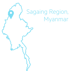
Sagaing Region, Myanmar

A study was conducted in Northern Nigeria to assess whether integrating SMC (Seasonal Malaria Chemoprevention) with Plumpy’doz™, a lipid-based nutrient supplement (LNS), has an impact on nutrition or malaria outcomes. It was found that among those who had taken SMC and LNS in the past 30 days, the prevalence of clinical malaria were 61% lower than among those who received SMC only. It also provided evidence of an enhanced protective effect of adding LNS to SMC against clinical malaria (Ward, 2019).