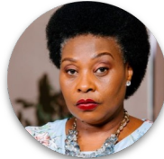
Yvonne Chaka Chaka Singer & Public Figure