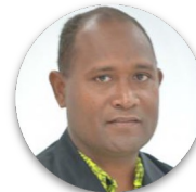
Culwick Togamana Government of Solomon Islands