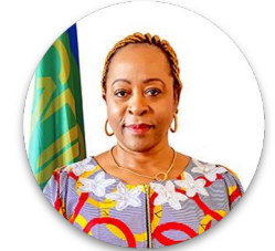
Angele Makombo N'Tumba

Commissioner for Gender Promotion, Human and Social Development Economic Community of Central African States (ECCAS)