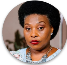
Yvonne Chaka Chaka Singer & Public Figure