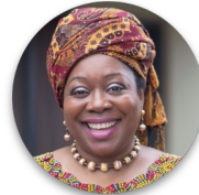
Lola Dare Chestrad Global