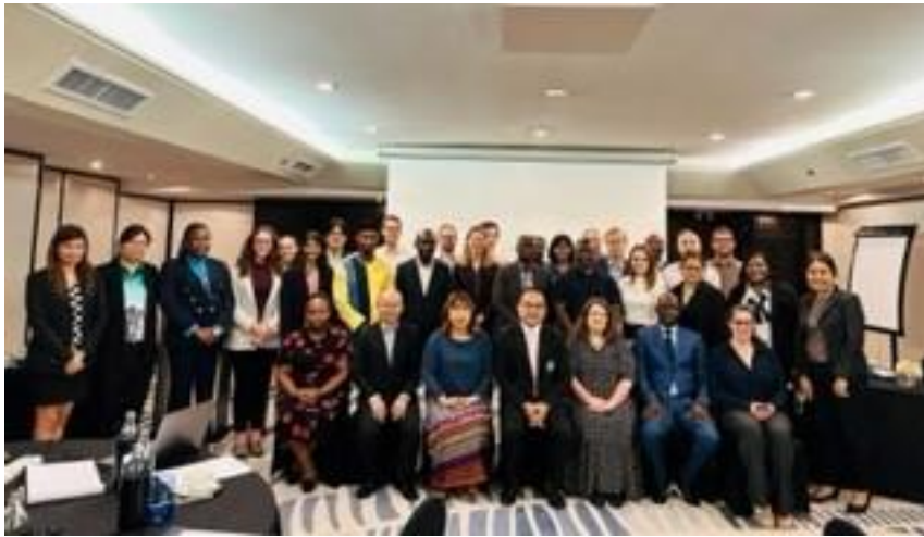
SMERG Participants and the DVBD Team